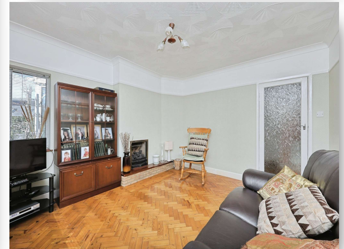
Park Lane, Norwich NR2 3EQ