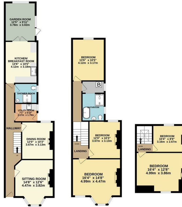
GROUND FLOOR 771 sq.ft. (71.6 sq.m.) approx.