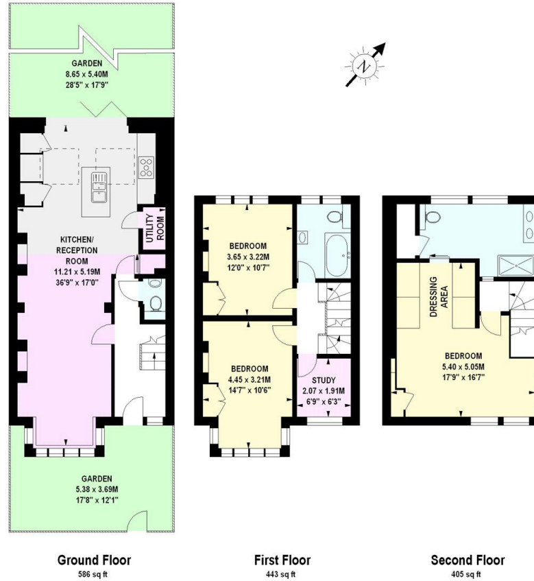
Illustration For Identification Purposes Only. Not To Scale *Floorplan Drawn According To RICS Guidelines

Chesterton UK Services Limited trading as Chestertons for themselves and for the vendor of this property whose agents they are, give notice that (i) these particulars do not constitute any part of an offer or contract, (ii) all statements contained within these particulars are made without responsibility on the part of Chestertons or the vendor, (iii) whilst made in good faith, none of the statements contained within these particulars are to be relied upon as a statement or representation of fact, (iv) any intending purchasers must satisfy themselves by inspection or otherwise as to the correctness of each of the statements contained within these particulars, (v) the vendor does not make or give either Chestertons or any person in their employment any authority to make or give representation or warranty whatsoever in relation to this property. Wide angle lenses may be used. ©Copyright Chestertons | Chesterton UK Services Limited | Registered Office 5th Floor, The Lantern, 75 Hampstead Road, London, NW1 2PL Registered Company Number 05334580.