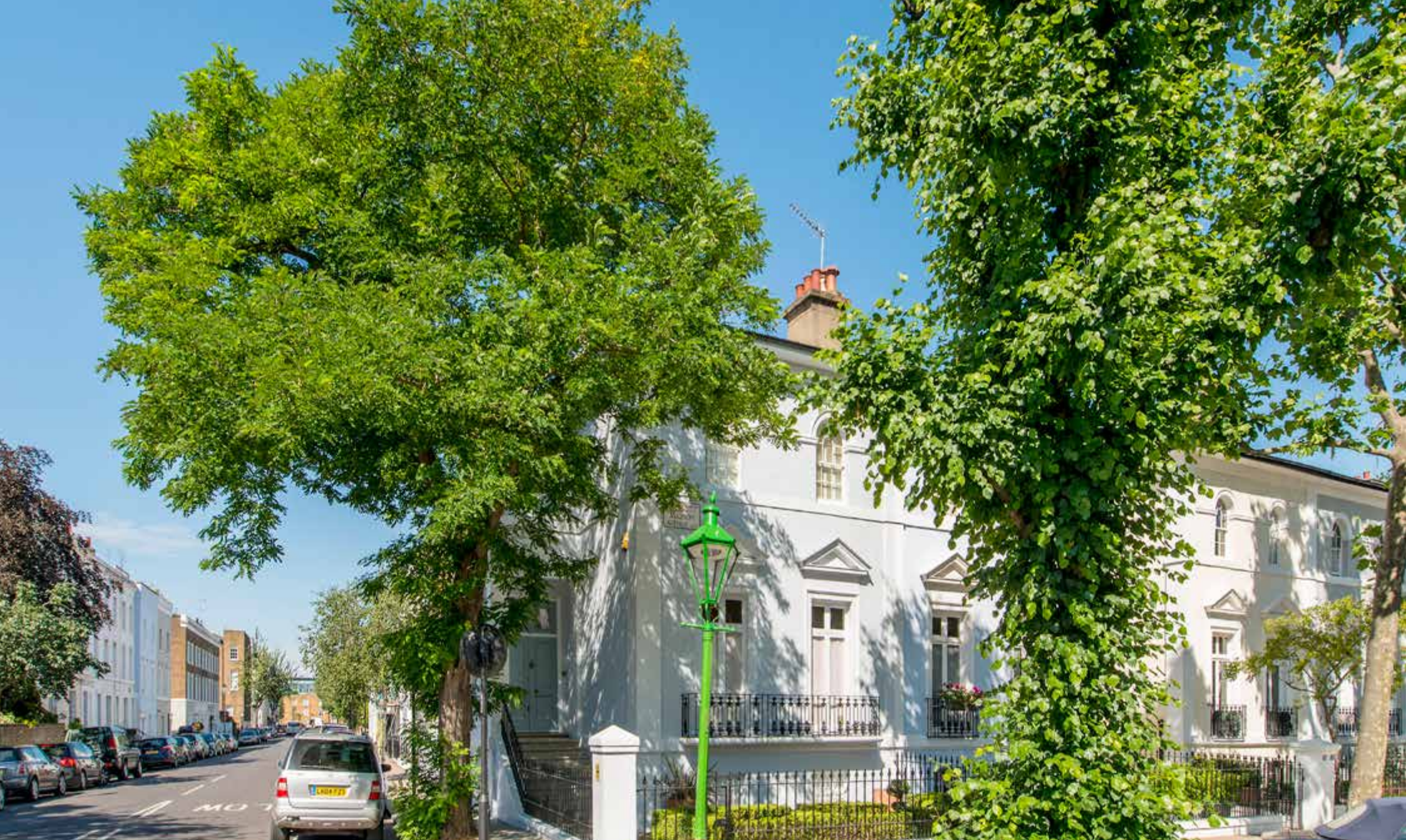
Addison Avenue W11