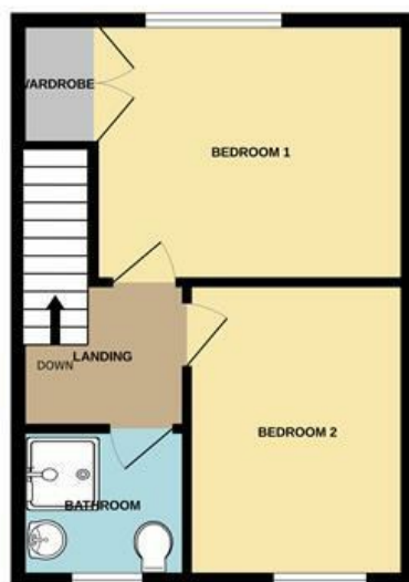
TOTAL FLOOR AREA: 677 sq.ft. (62.9 sq.m.) approx.

Whilst every attempt has been made to ensure the accuracy of the floorplan contained here, measurements of doors, windows, rooms and any other items are approximate and no responsibility is taken for any error, omission or mis-statement. This plan is for illustrative purposes only and should be used as such by any prospective purchaser. The services, systems and appliances shown have not been tested and no guarantee as to their operability or efficiency can be given.