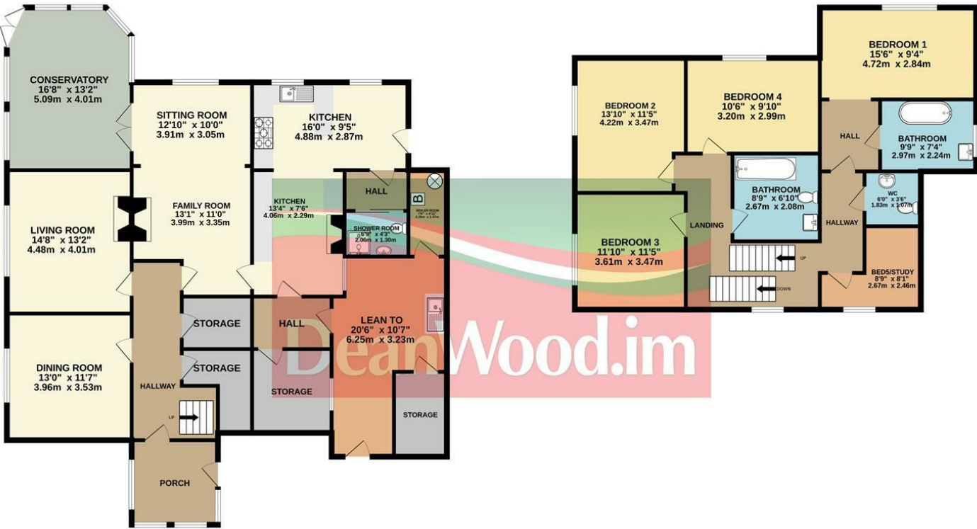
1ST FLOOR 1065 sq.ft. (98.9 sq.m.) approx.

TOTAL FLOOR AREA : 2840 sq.ft. (263.9 sq.m.) approx. Not to scale-for identification purposes only Made with Metropix ©2023