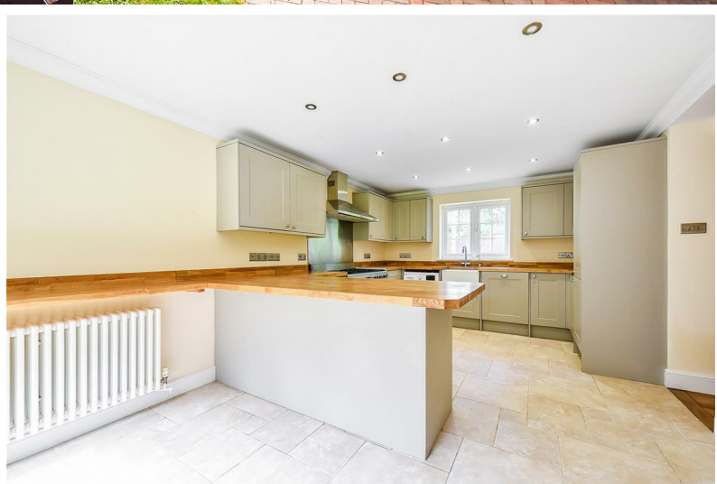
Hemple House , Hatherden, Andover, SP11 0HT Guide Price £650,000