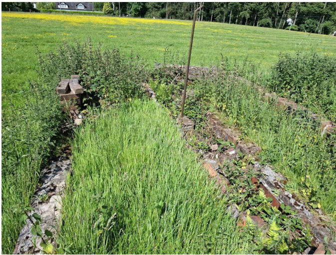
Totalling approximately 70 square meters. footings of former buildings.