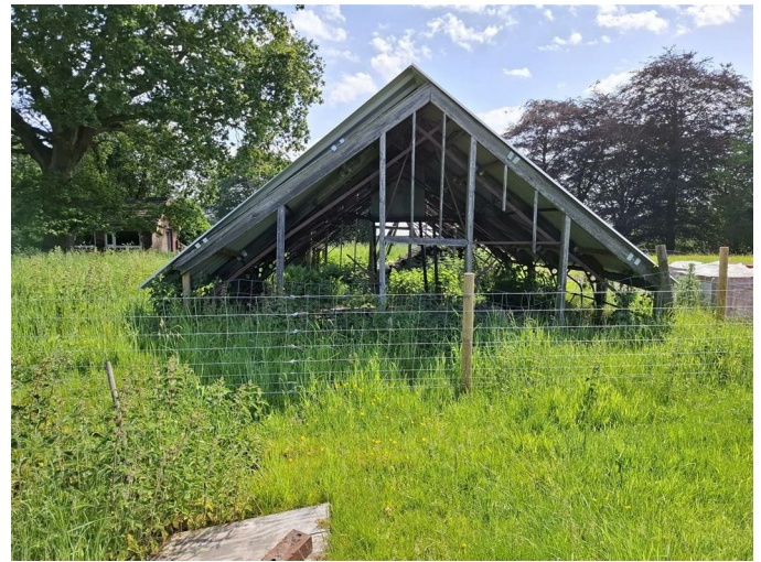
Two wooden triangular framed storage buildings.