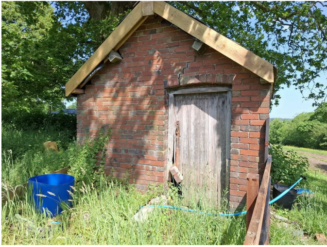
Two Brick Footprints