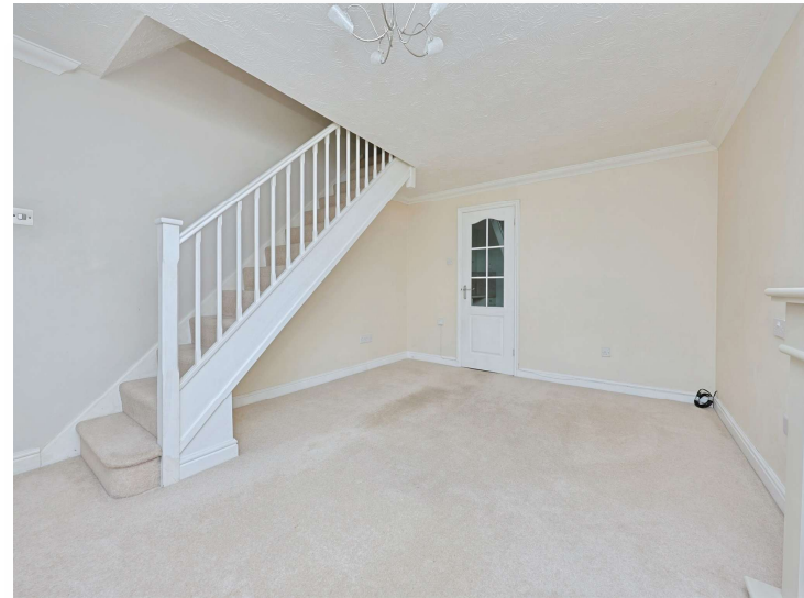
Bluebell Close, Scarning, Dereham, NR19 2UQ