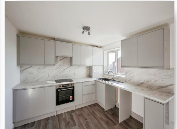
Hills Close, Mexborough S64 9PB