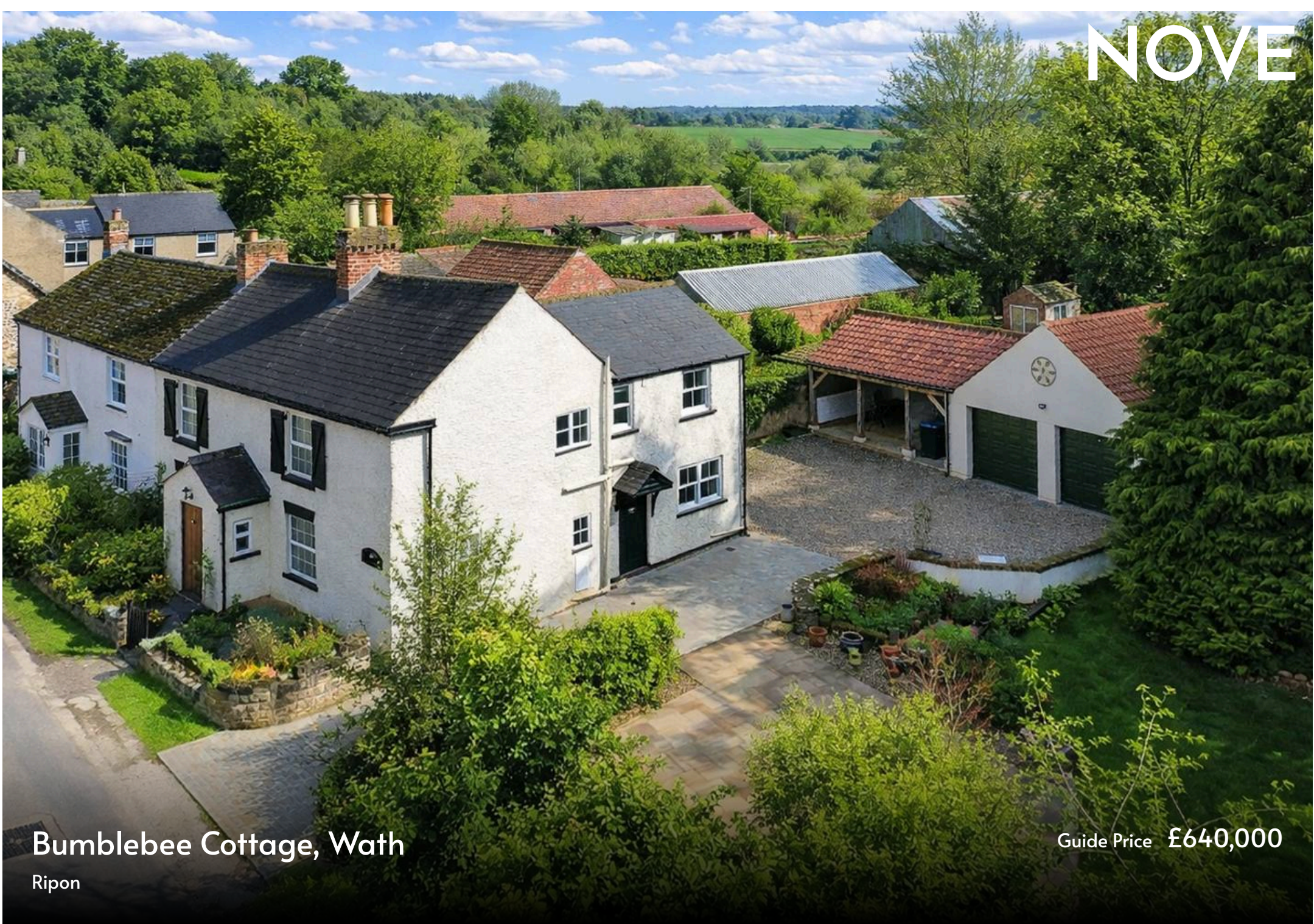
Bumblebee Cottage, Wath