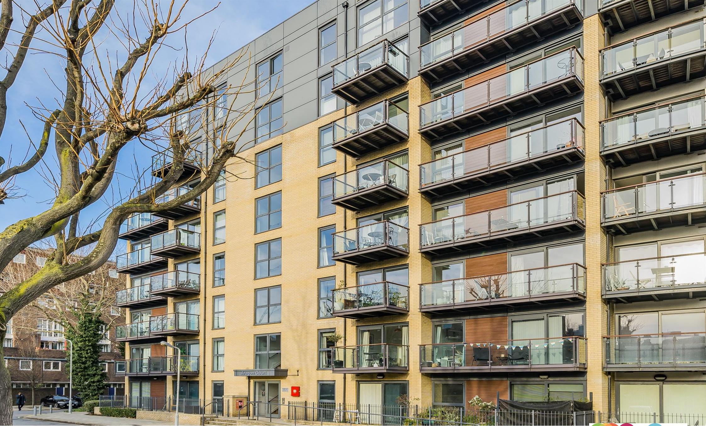
Aragon Court Hotspur Street, London SE11