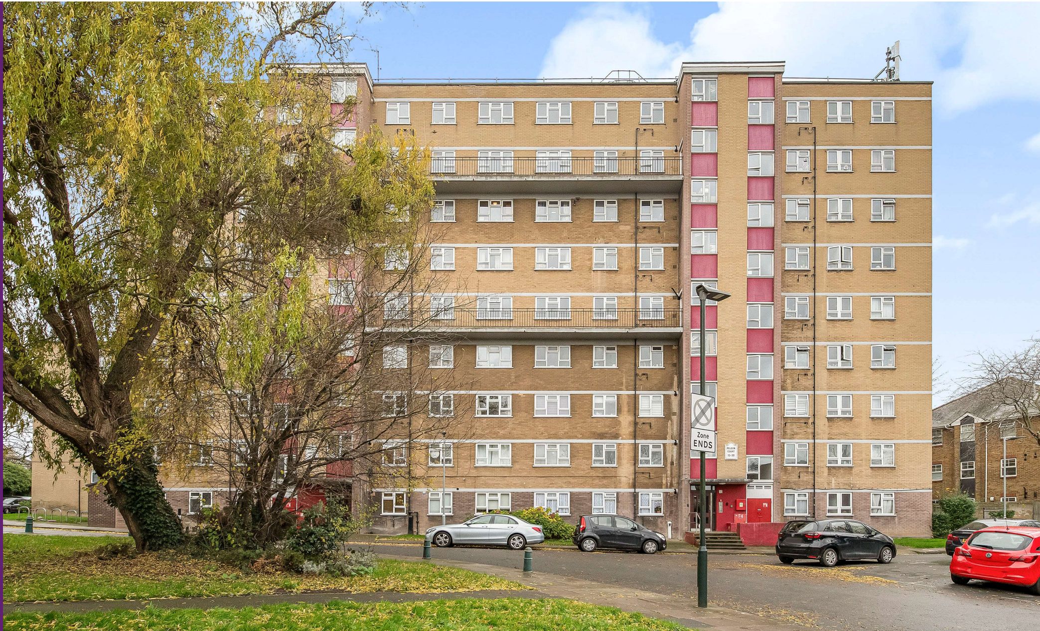
Peldon Court Sheen Road, TW9