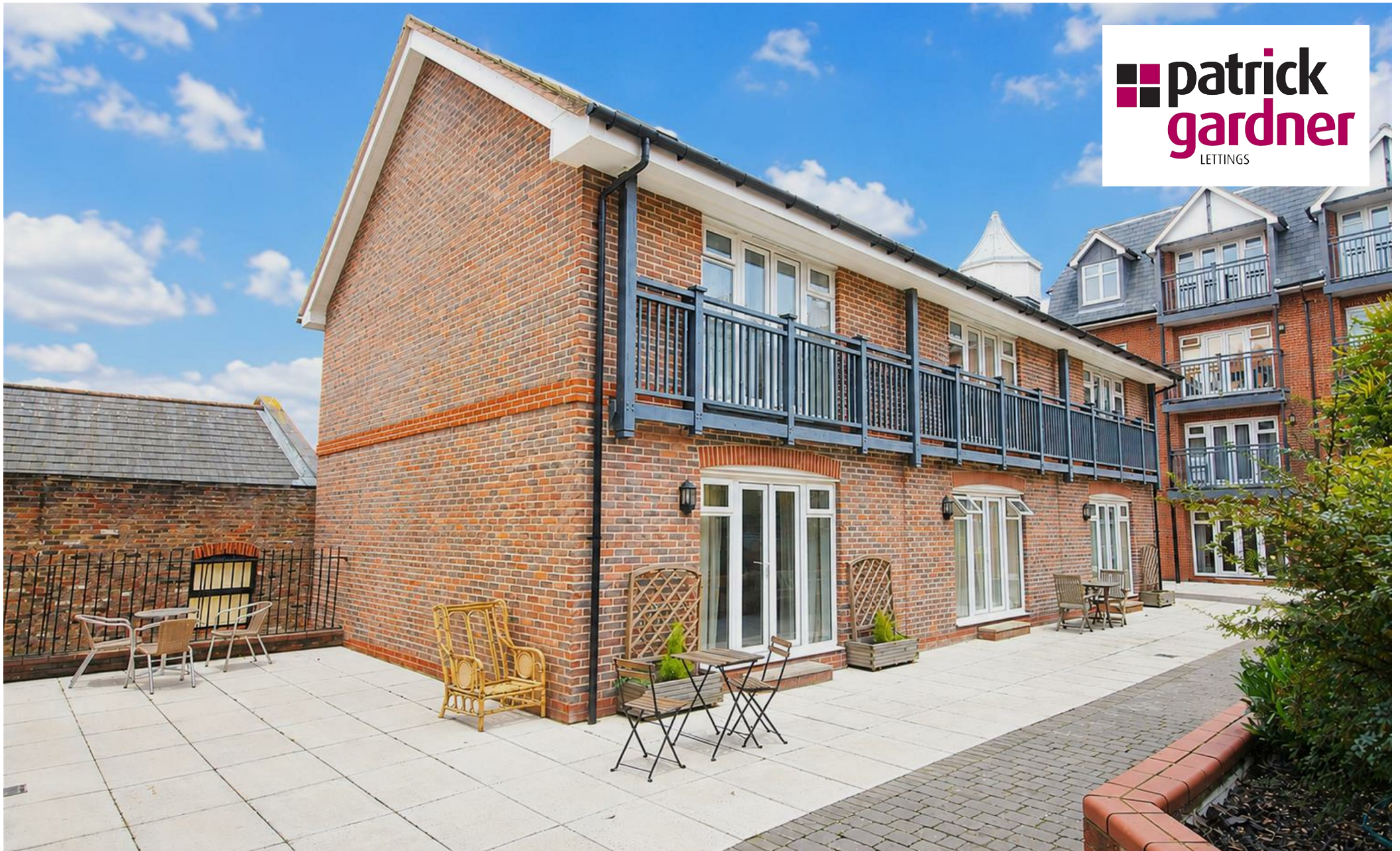
Leret Way, Leatherhead, KT22 7JL