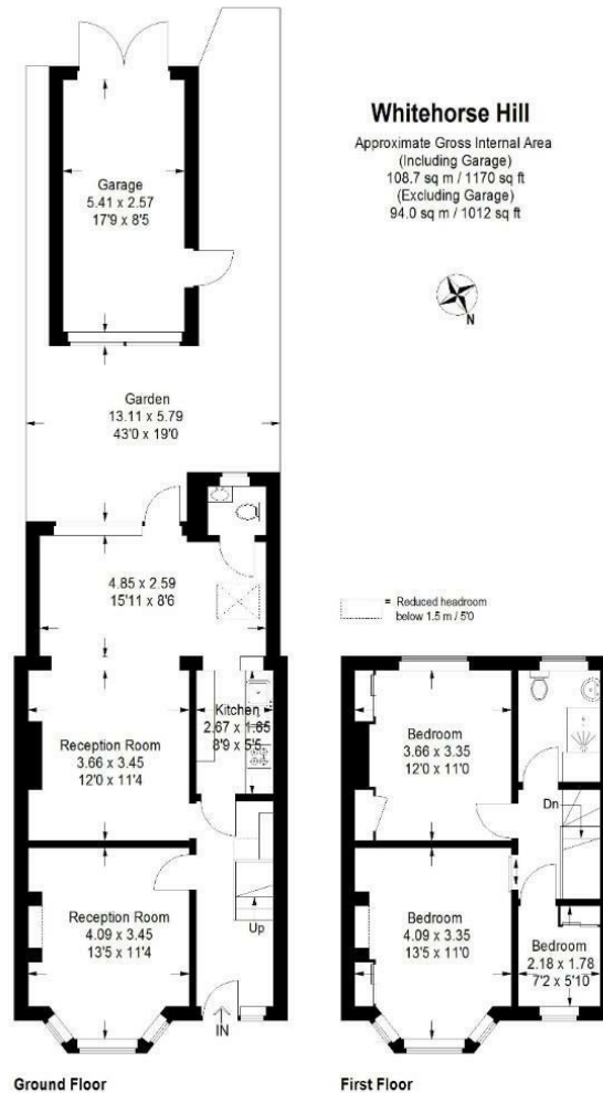
Illustration for identification purposes only, measurements are approximate.