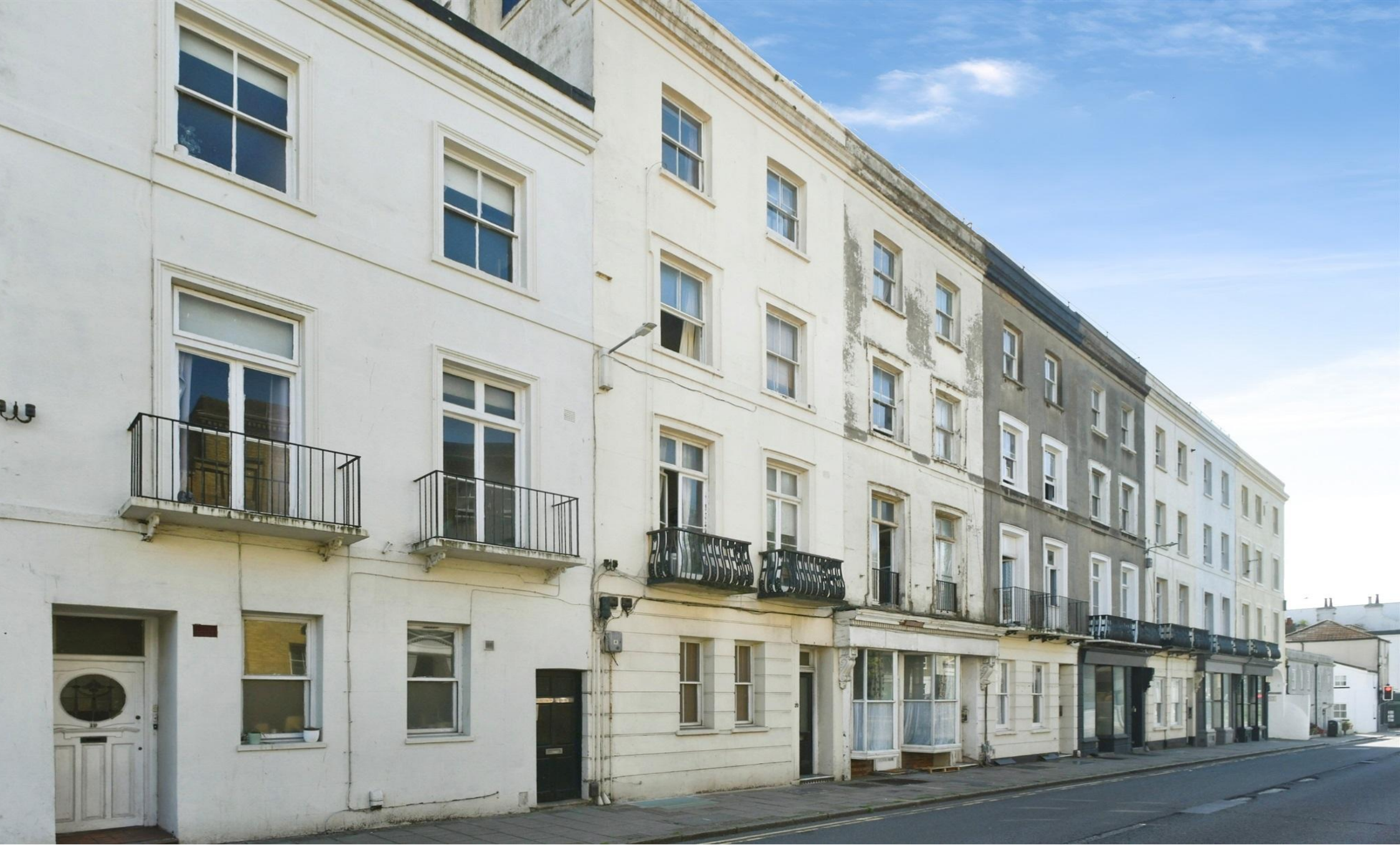
Bristol Road, Brighton, BN2 1AP