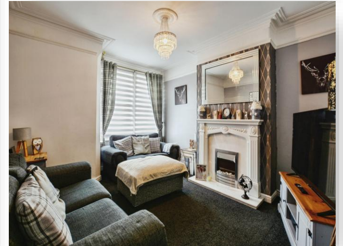
Clifton Grove, Skegness PE25 3HB