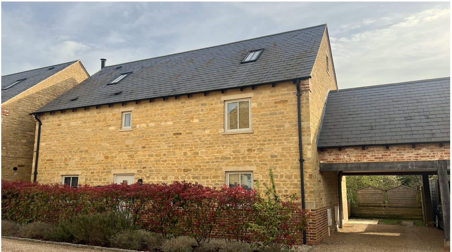
THE ELMS, SILVERSTONE, NORTHANTS, NN12 8WD

3-4 Horsefair • Banbury • Oxfordshire • OX16 0AA Telephone: 01295 275909 • Email: info@steppingstonesletting.com