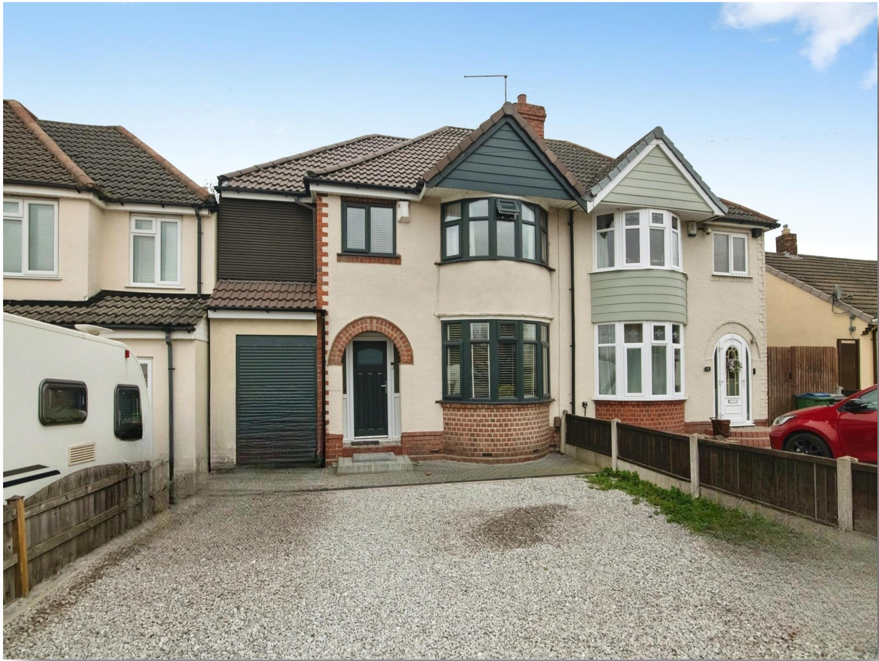
Forge Lane, Cradley Heath B64 5AL