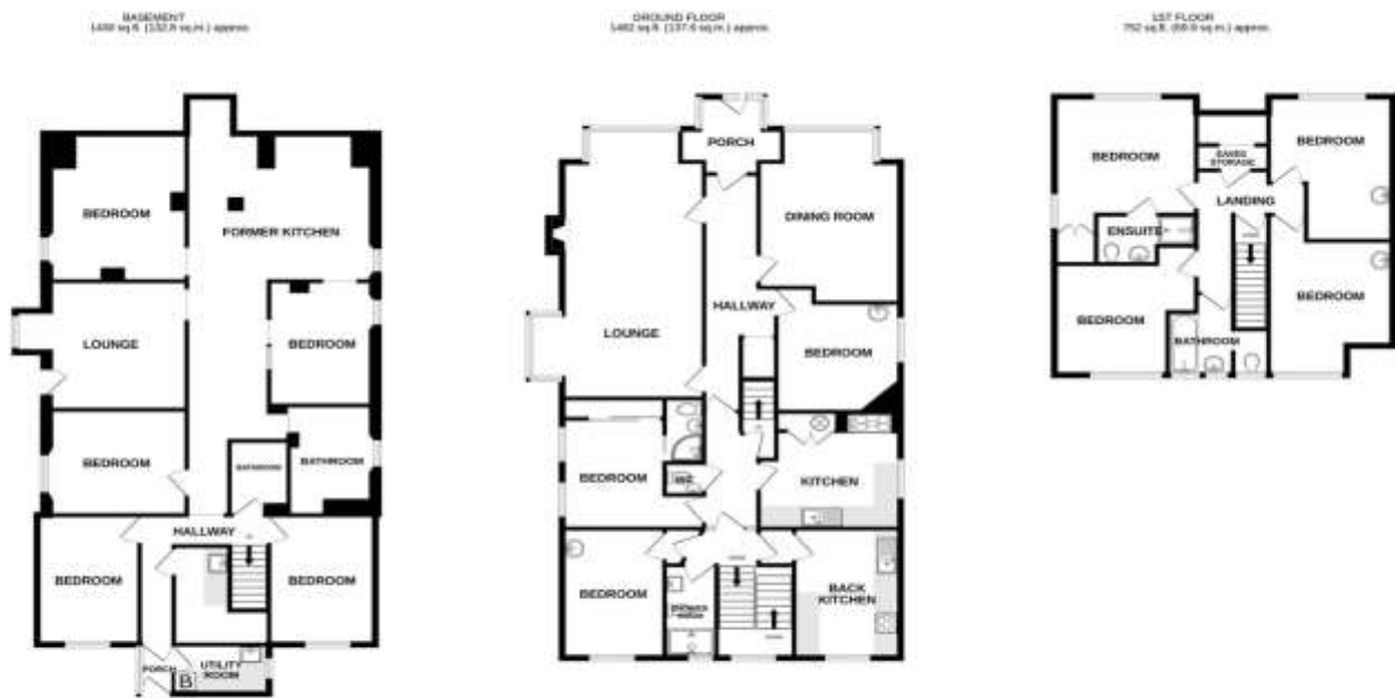
TOTAL FLOOR AREA : 3663 sq ft. (340.3 sq.m.) approx. Whilst every attempt has been made to ensure the accuracy of the floorplan contained here, discrepancies of doors, windows, closets and other details are approximate and no responsibility is taken for any errors, omissions or mis-statements. This plan is for illustrative purposes only and should be used as such by any prospective purchaser. The vendors, agents and appraisers herein have not been stated and no guarantee is in their responsibility or efficiency can be given. Made with Metrigix 12/2014

Intending purchasers will be asked to produce identification documentation at a later stage and we would ask for your co-operation in order that there will be no delay in agreeing the sale.