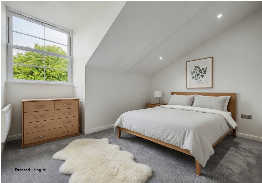
Dressed using AI