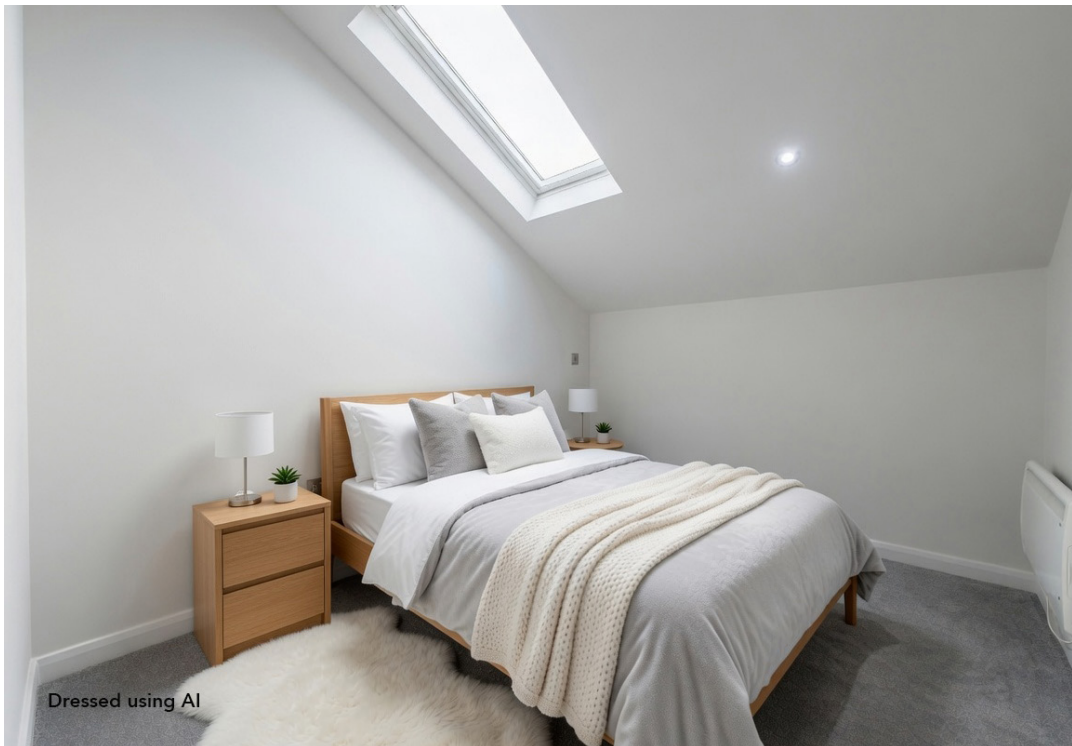
Dressed using AI