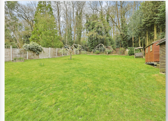
Five Oaks, Rectory Road, Elsing, Dereham, NR20 3EG