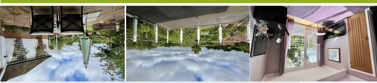
White Lodge Sea Road, Fairlight, TN35 4DR

Whilst every attempt has been made to ensure the accuracy of the floorplans contained here, measurements of rooms, windows, rooms and any other items are approximate and no responsibility is taken for any error or omission or mis-statement. This plan is for illustrative purposes only and should be used as such by any prospective purchaser. The services, systems and appliances shown have not been tested and no guarantee as to their operability or efficiency can be given. Made with Metropix ©2024