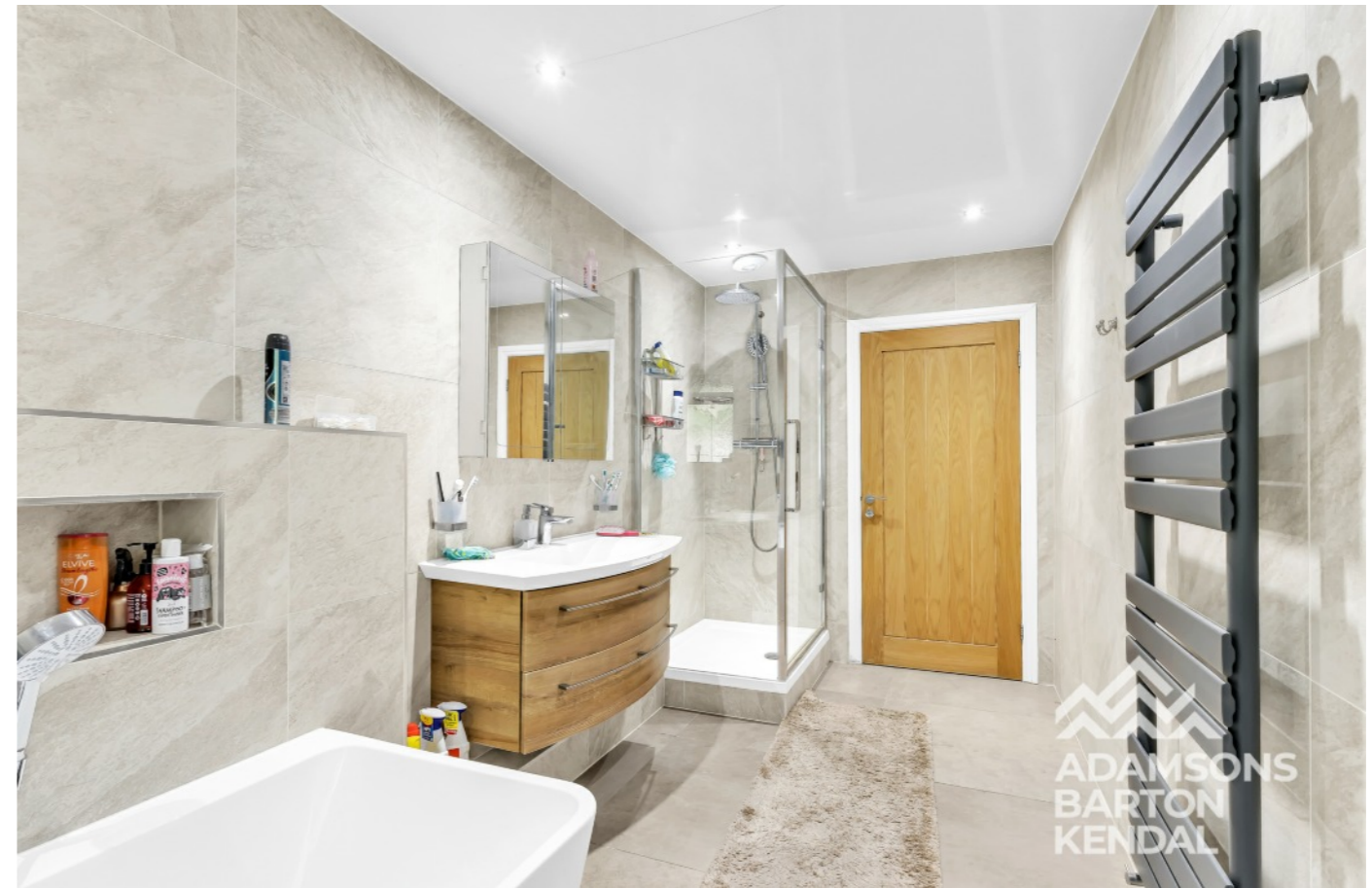
The Coach House, 33 Spring Bank Lane, Rochdale OL11 5SE