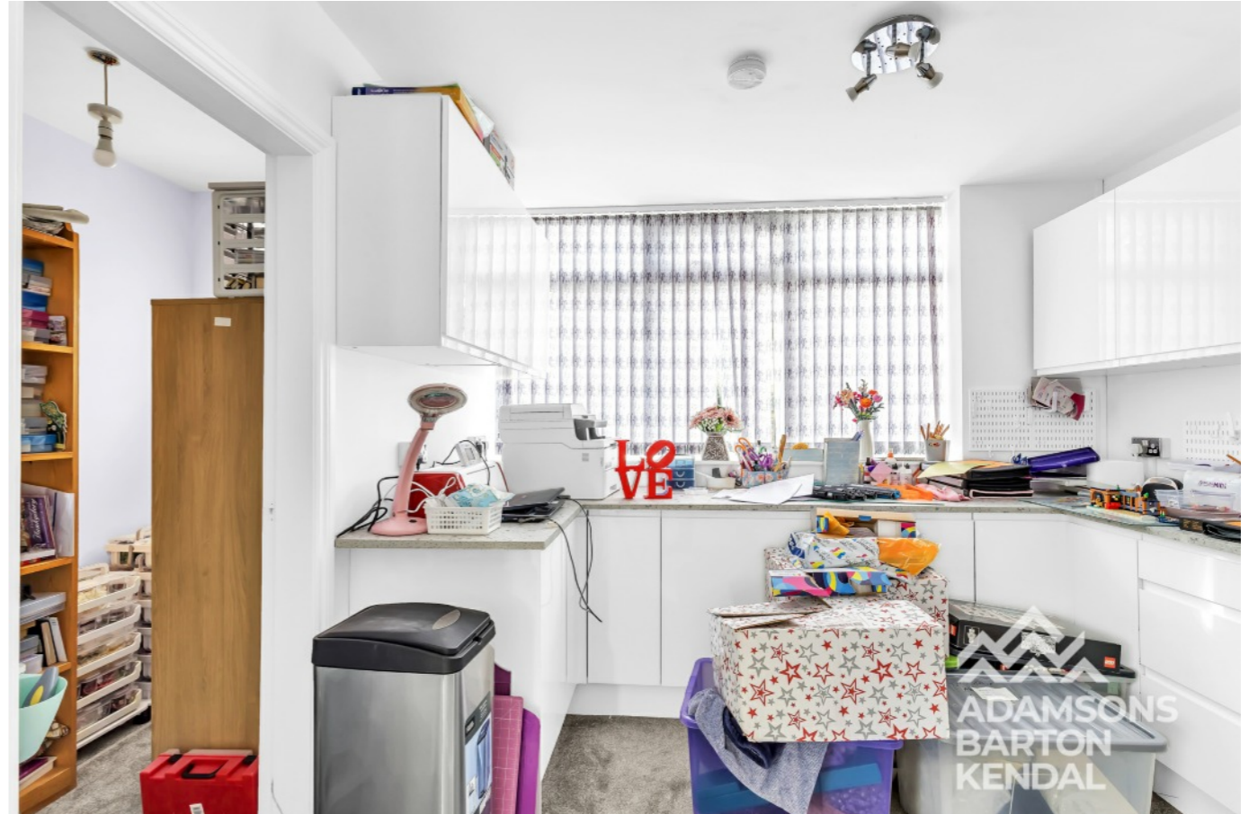
The Coach House, 33 Spring Bank Lane, Rochdale OL11 5SE