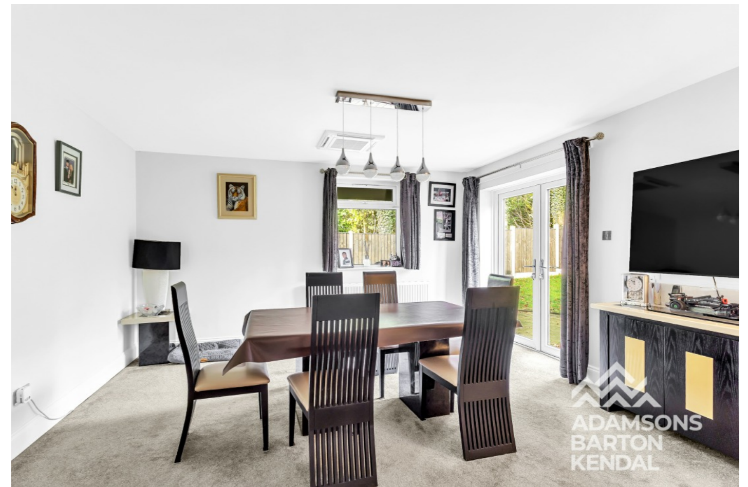
The Coach House, 33 Spring Bank Lane, Rochdale OL11 5SE