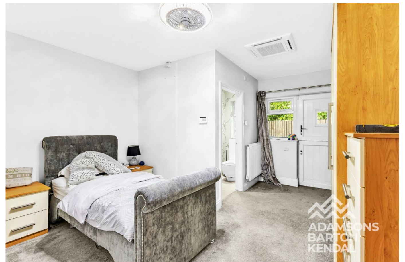
The Coach House, 33 Spring Bank Lane, Rochdale OL11 5SE