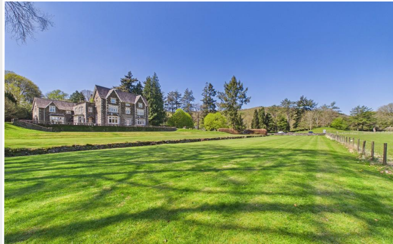
Front external and shared garden