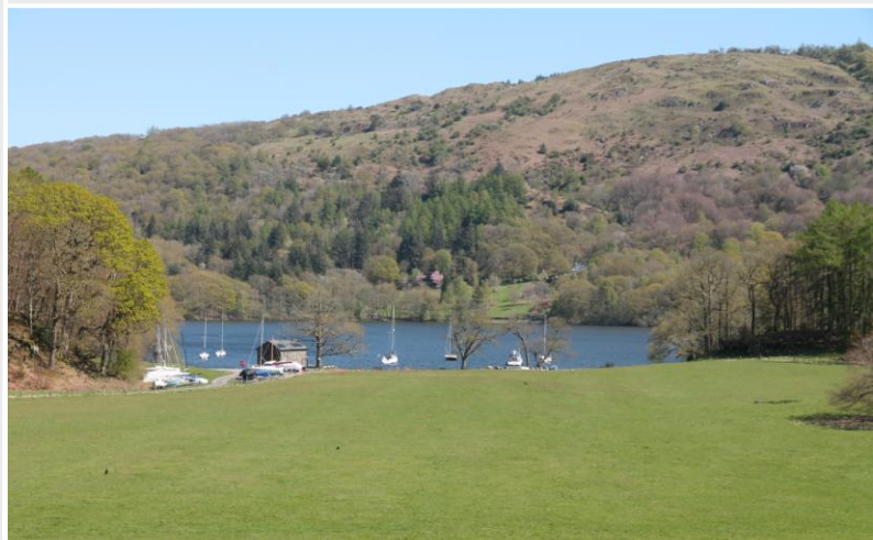
View from kitchen