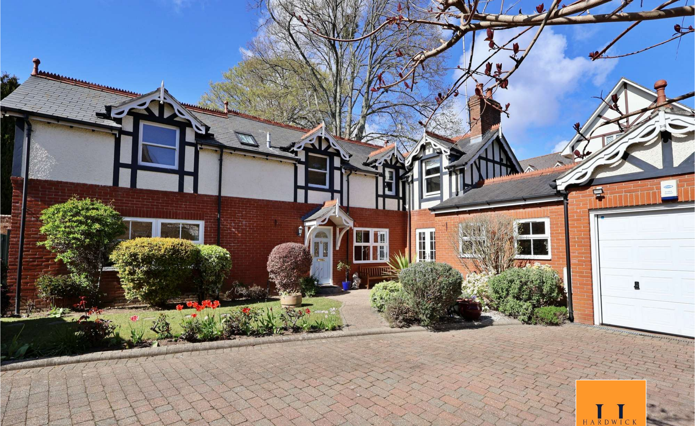
The Coach House, 33 Cavendish Road Bournemouth, BH1 1QZ