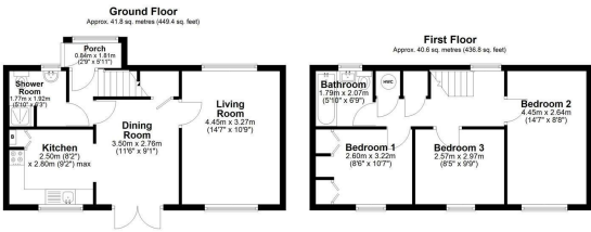
Total area: approx. 82.3 sq. metres (886.2 sq. feet)