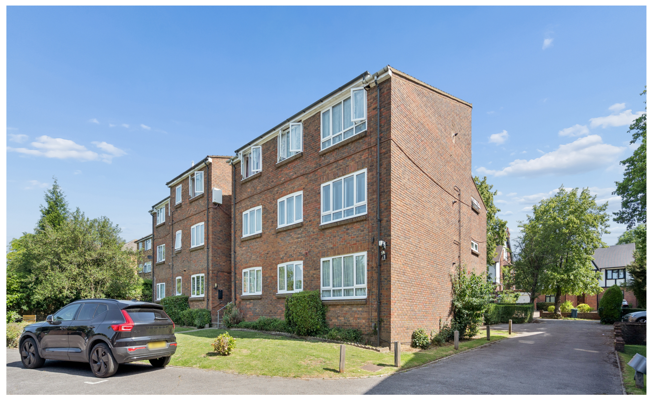
A two bedroom ground floor apartment within walking distance of local amenities Lime Tree Court ,Hatch End, HA5 4UX