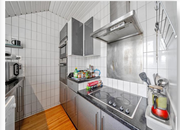
30 Lynton Green, Maidenhead SL6 6AN