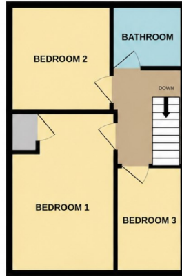
1ST FLOOR 405 sq.ft. (37.7 sq.m.) approx.