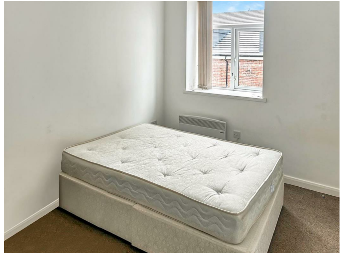
Window, electric wall mounted heater