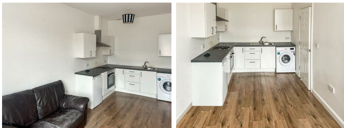
A range of storage units, stainless steel sink and drainer, built in oven and hob with extractor fan over, plumbing for a washing machine, space for a fridge, electric wall mounted heater, two windows