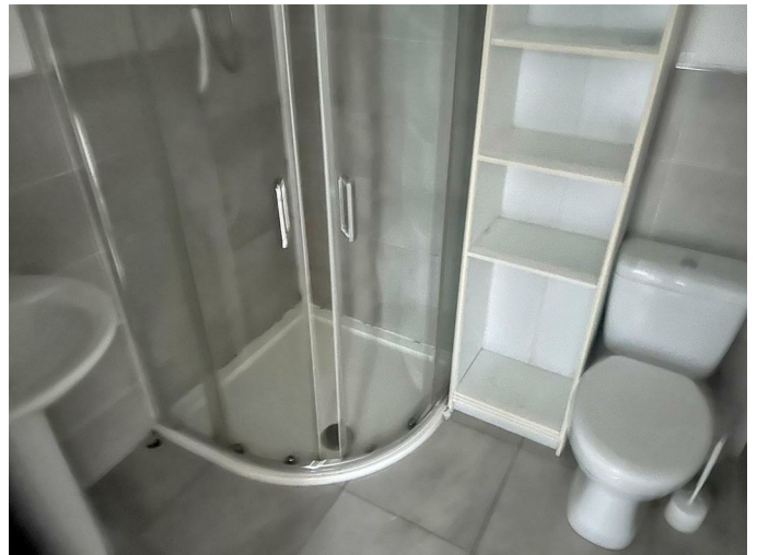
A three piece suite in white comprising of a shower cubicle, a wash basin and a WC