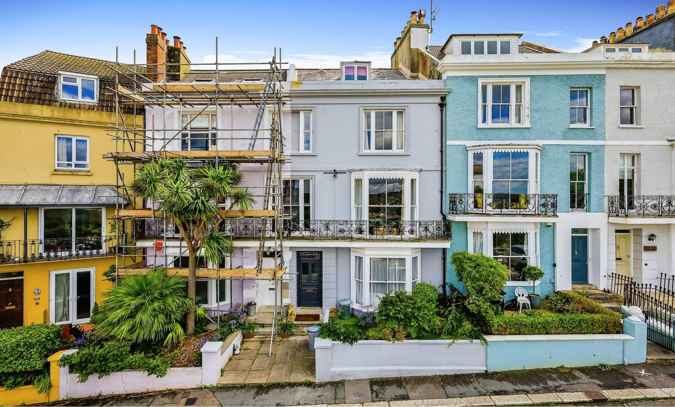
St. Marys Terrace, Hastings TN34 3LR