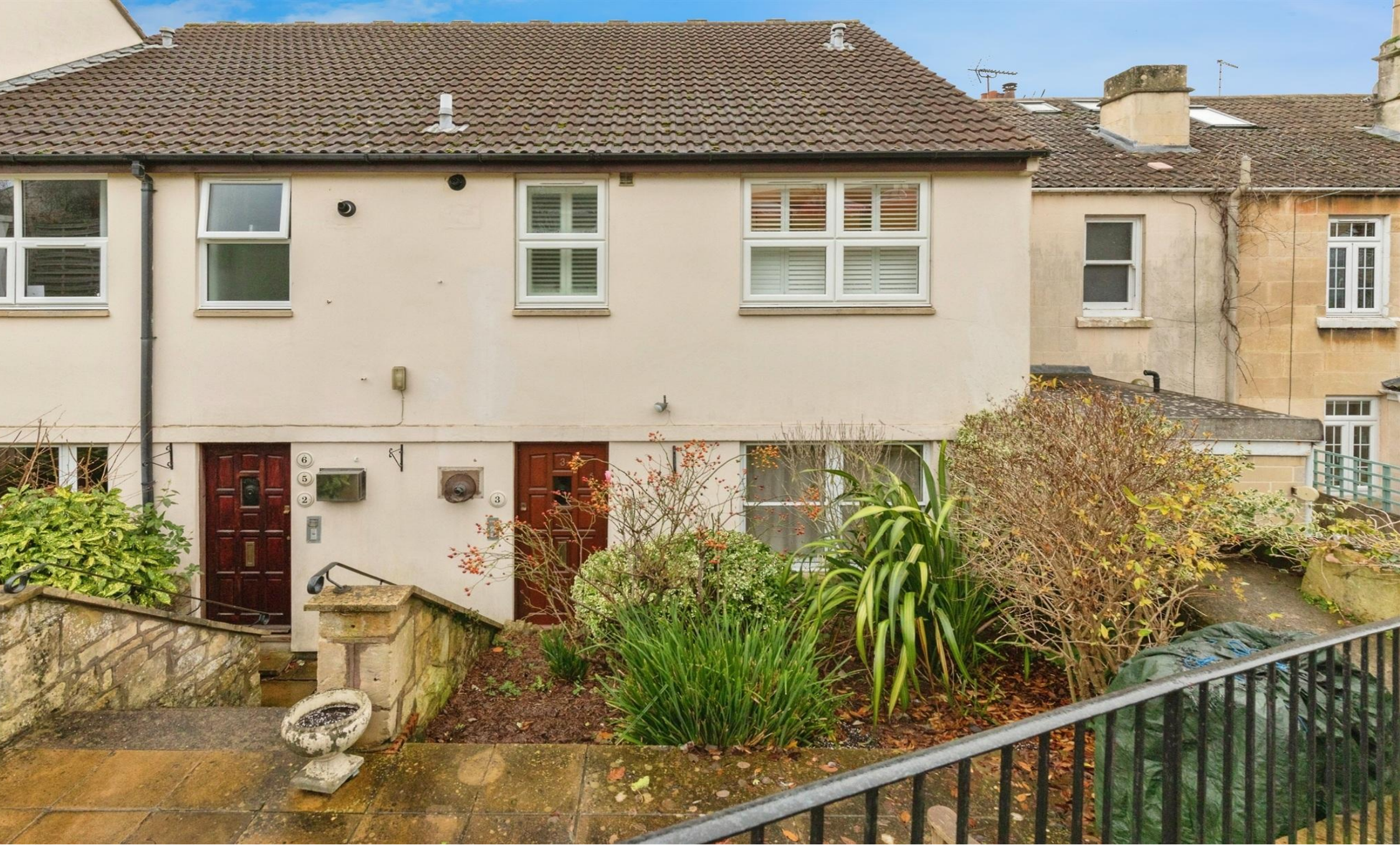
Chilton Court, Tynning Lane, Bath, BA1 6EQ