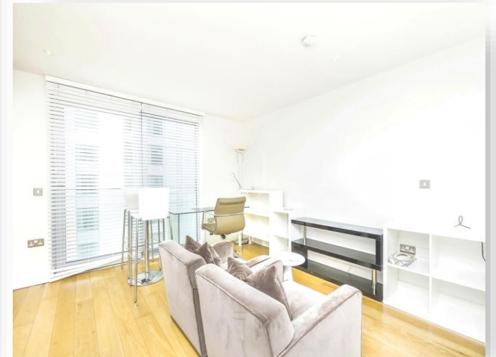
Meridian Plaza Bute Terrace, Cardiff CF10 2FQ