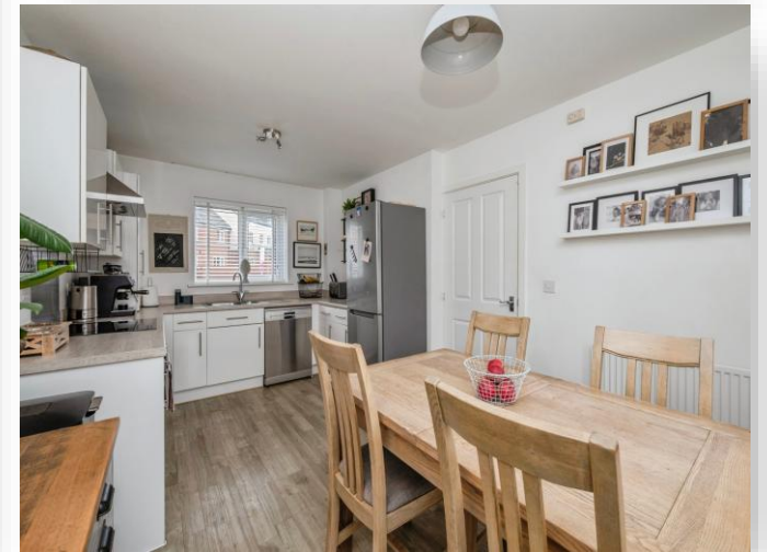
Hobart Lane, Aylsham, Norwich, NR11 6FA