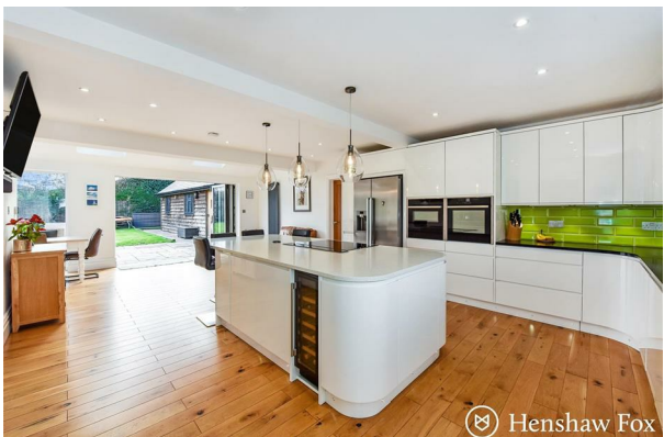
The Jays | £850,000 Winsor Road, Winsor, Hampshire, SO40 2HE