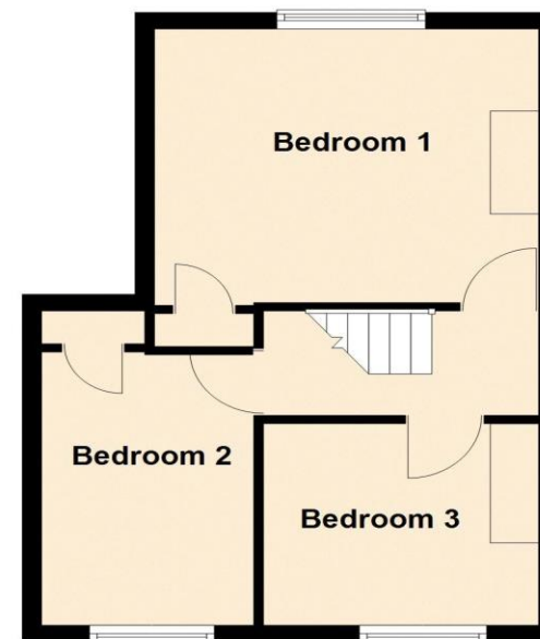
First Floor Approx. 33.3 sq. metres (358.0 sq. feet)

Total area: approx. 81.1 sq. metres (873.1 sq. feet)