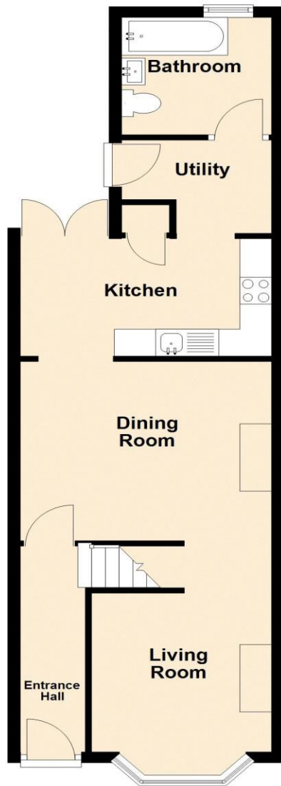
Ground Floor Approx. 47.9 sq. metres (515.1 sq. feet)