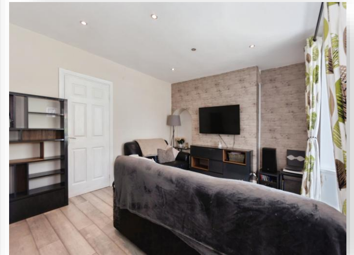
Mansion Crescent, Smethwick B67 6QW