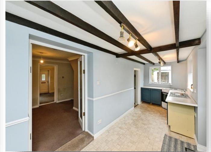
Field Lane, Gaywood, King's Lynn, PE30 4AX