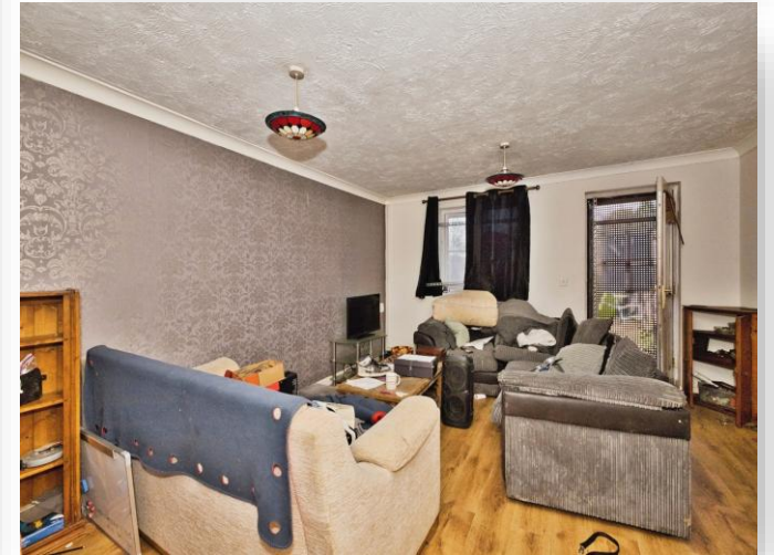
Raglan Terrace, Yeovil, BA21 3JX