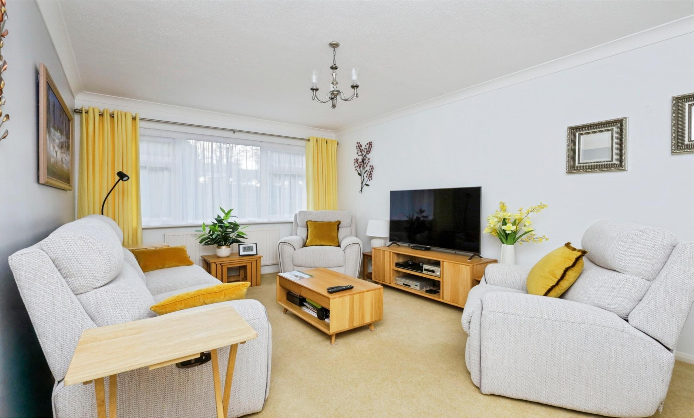
Broad Oak Coppice, Bexhill-On-Sea TN39 4PU