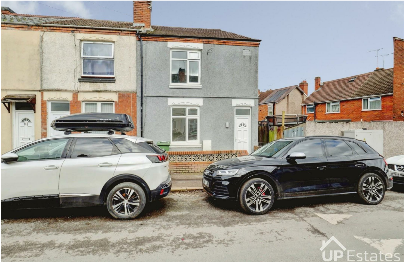
Eld Road, Coventry