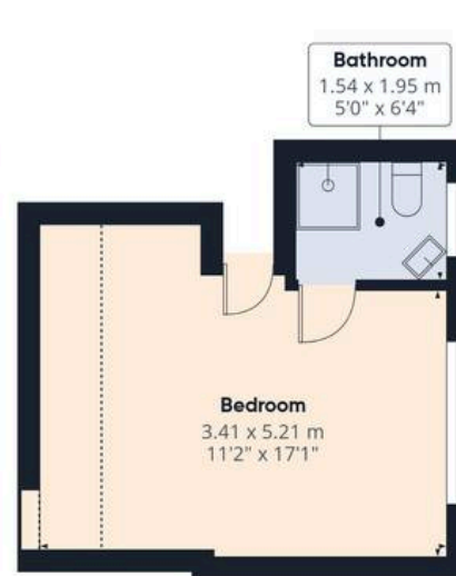
Floor 3 Building 1