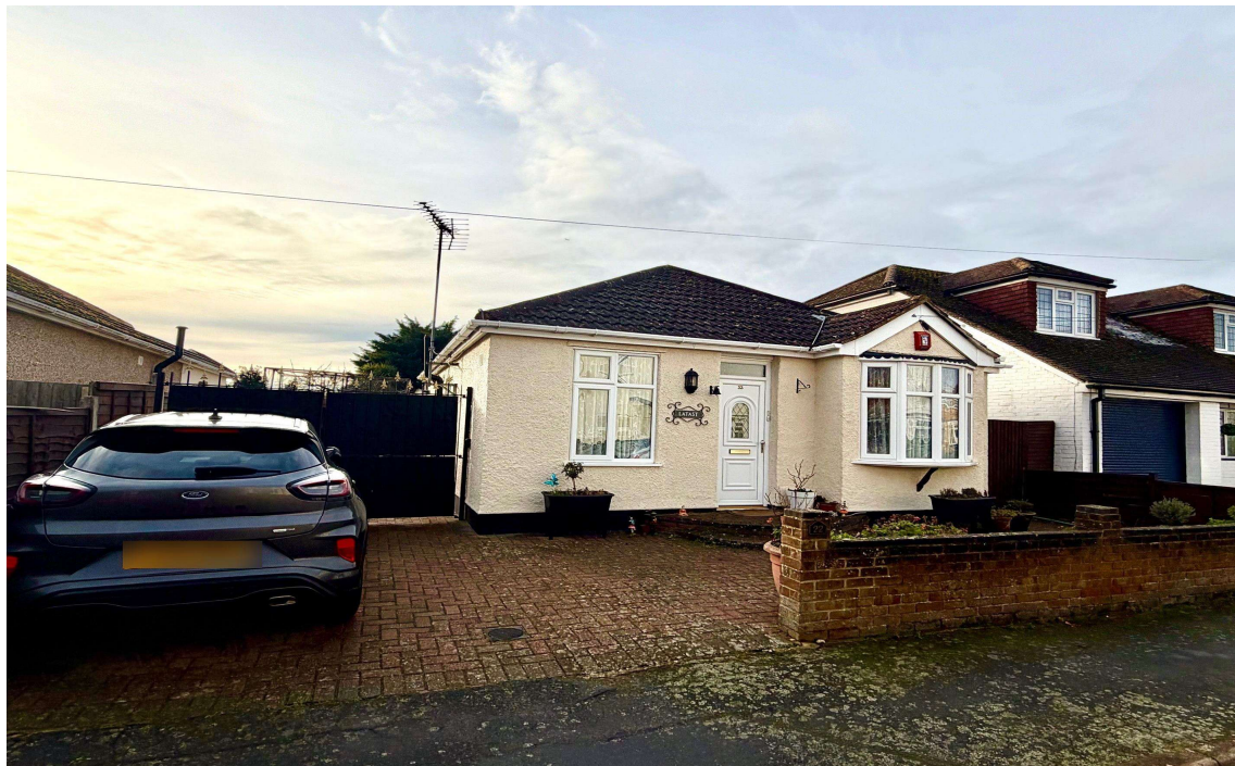
Cambridge Road, Ashford, TW15 1UF