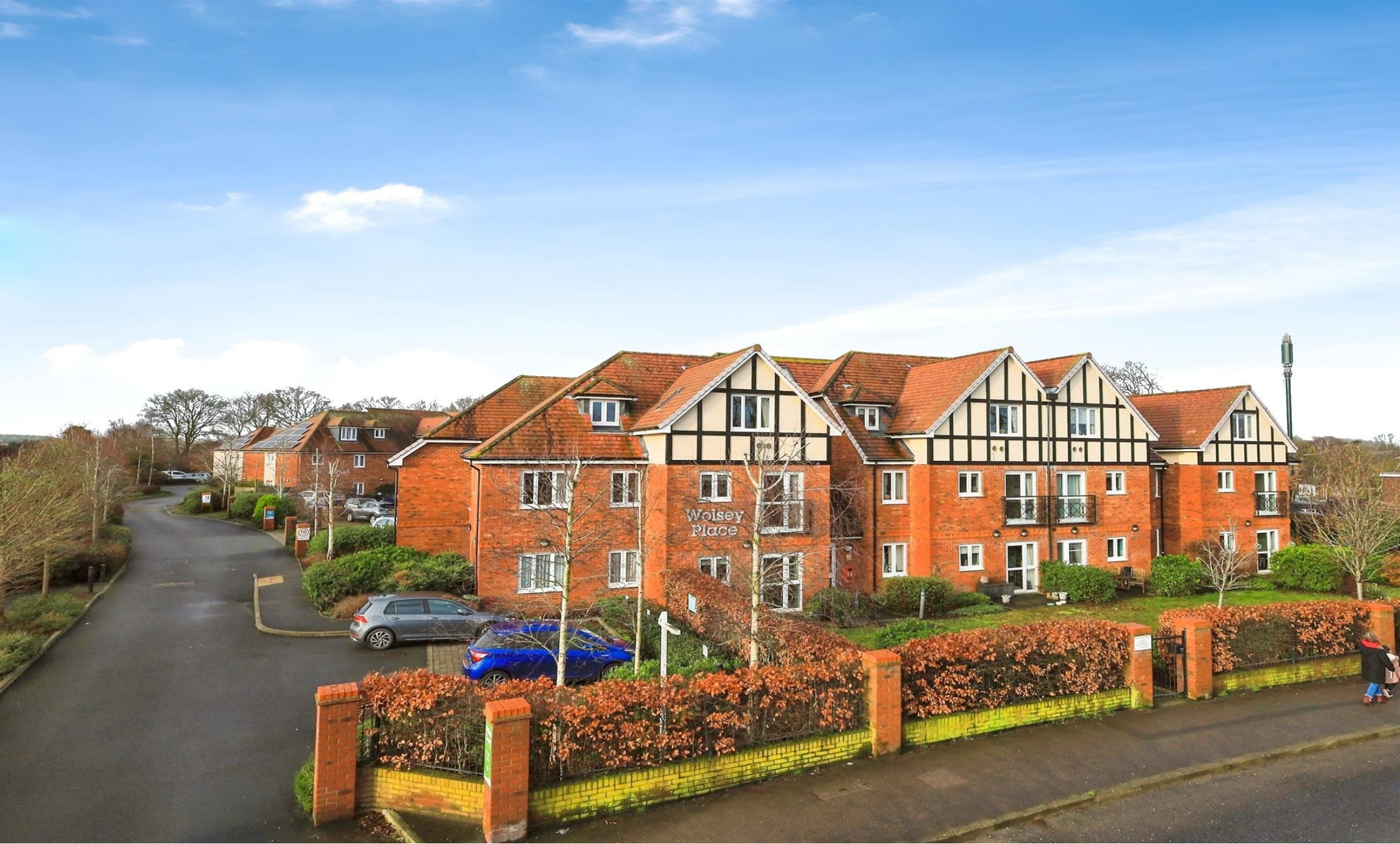
Wolsey Place, London Road, Hailsham BN27 3FU