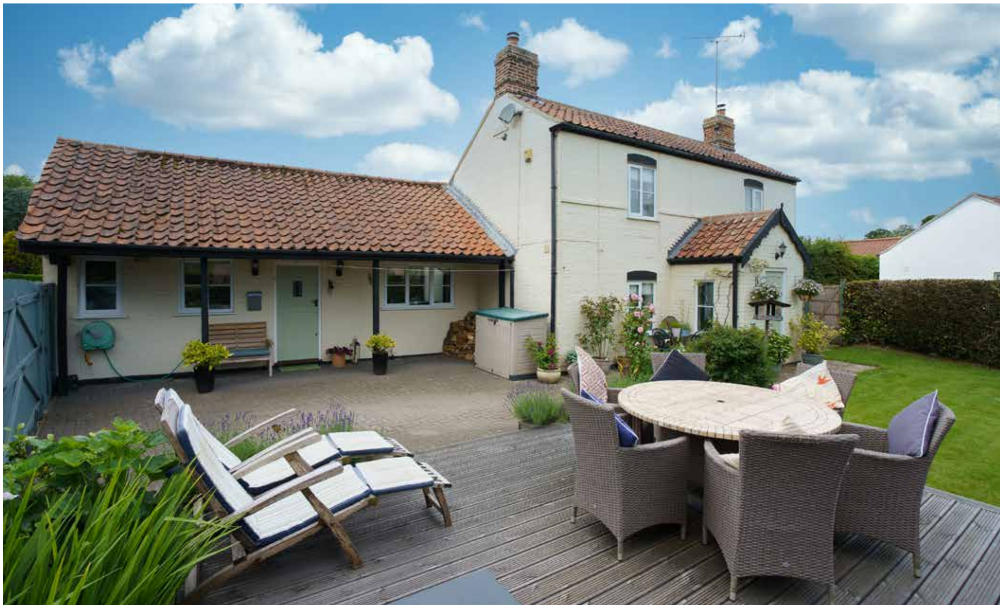
East View Cottage 119 Lower Street | Salhouse | Norfolk | NR13 6AD