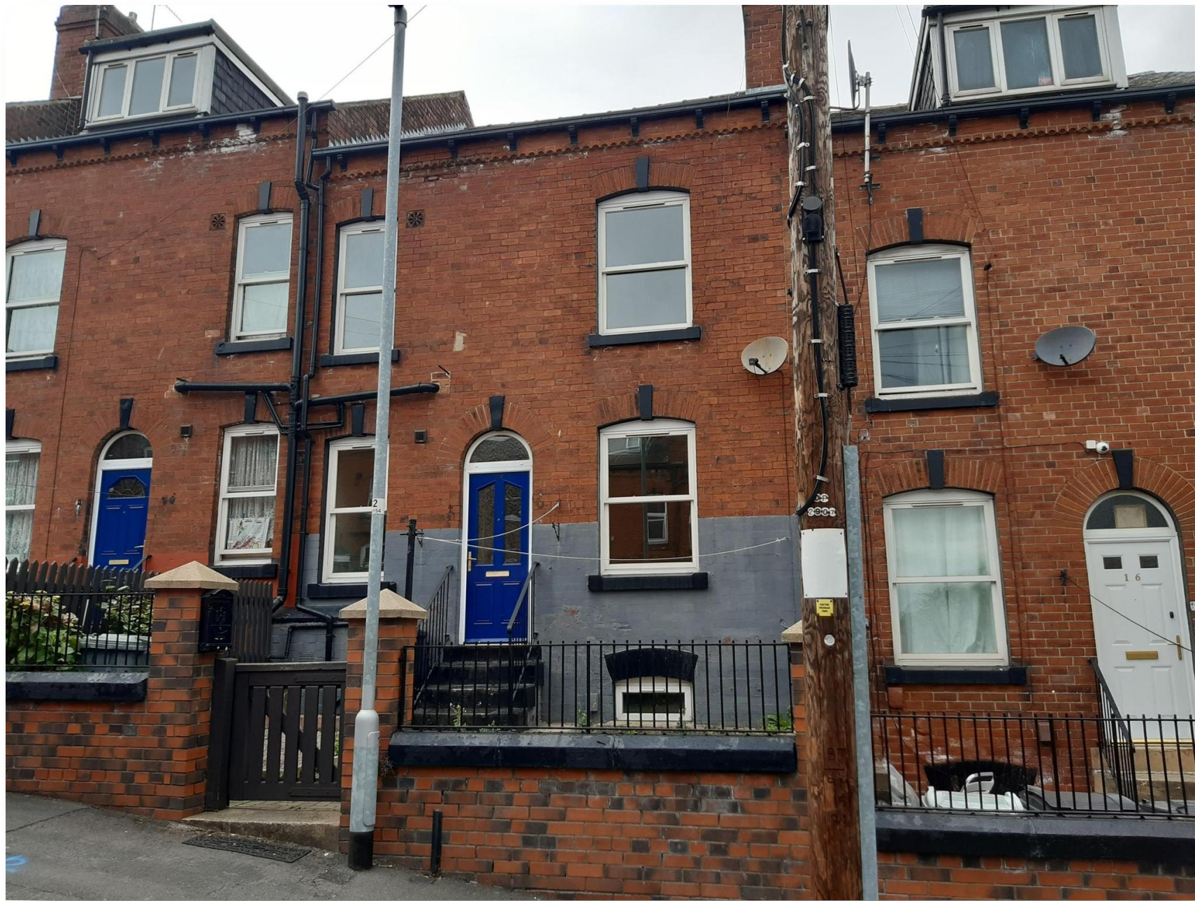
Barton Grove, Leeds LS11 8TW