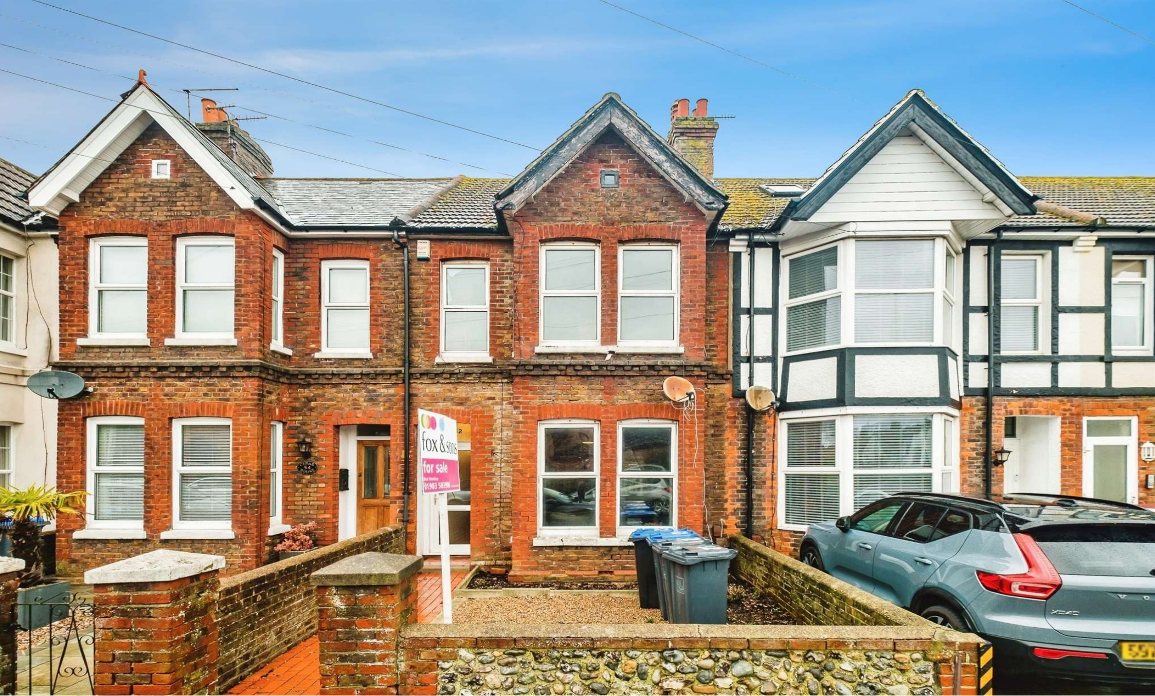
Canterbury Road, Worthing BN13 1AE