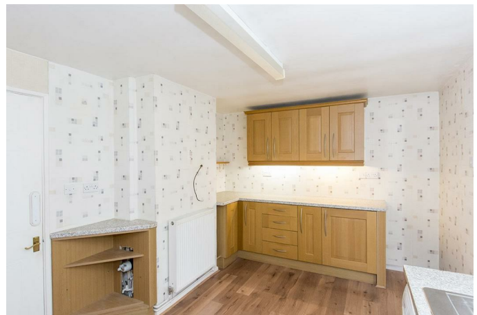
Breakfast Kitchen (Photo Two)

Fitted with a wide range of modern oak cabinets and work surfaces over, the kitchen briefly comprises of; a stainless steel sink with mixer taps over, a built under oven with a gas hob and extractor fan. An integrated freezer and space for a washing machine. The kitchen also benefits from a pantry and a radiator.