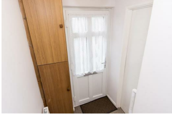
Hall 4'8" x 3'9" (1.42m x 1.14m)

Enter the property via a UPVC front door, to where you will find the stairs rising to the first floor. A radiator.