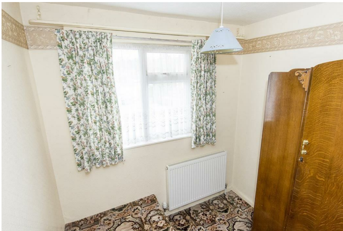
Bedroom Three 7'3" x 9'7" (2.21m x 2.92m)

A single bedroom with a window to the front and a radiator.