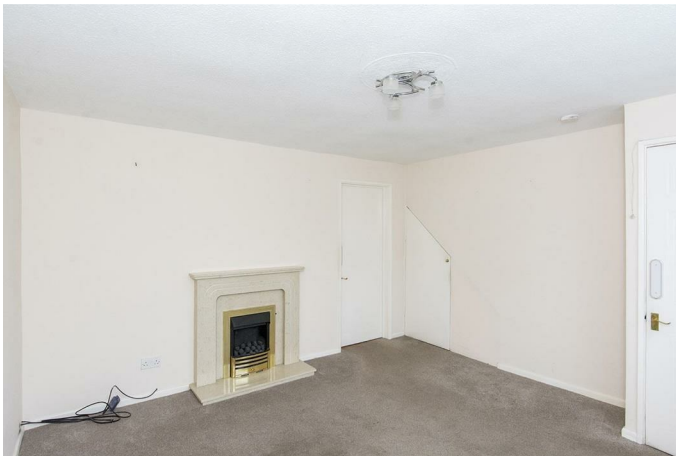
Lounge 10'11" x 12'11" (3.33m x 3.94m)

This cozy lounge a window to the front aspect, boasting an abundance of natural light to flow into this room. The space is benefits from a fireplace housing a gas fire and a radiator - a great addition for these cozy months.