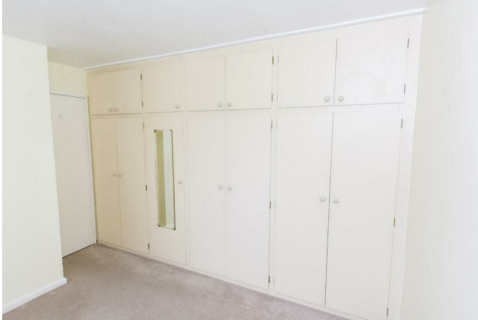
Bedroom Two (Photo Two)