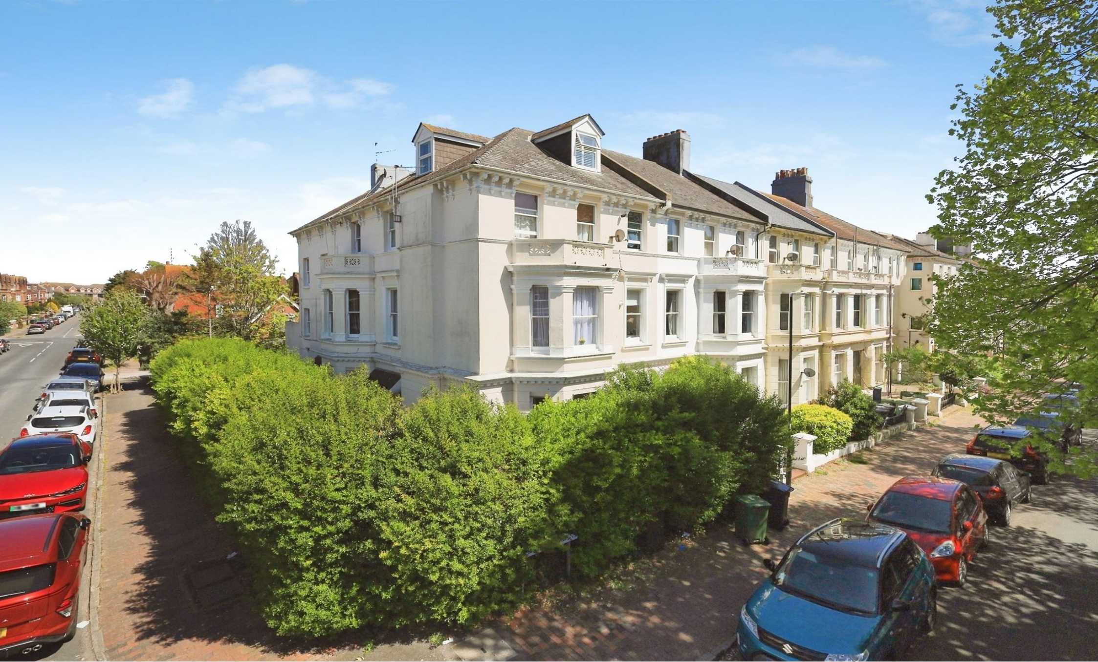
Upperton Gardens, Eastbourne BN21 2AH